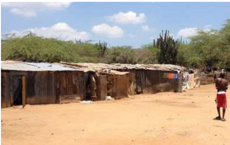
Photo 1: A typical 'batey' housing migrant workers in Montecristi province

The Dominican Republic banana industry has steadily grown in the last 15 years, benefitting from the country's duty-free access to the EU single market as a member of the ACP (African, Caribbean and Pacific) group of countries. The United Kingdom is far and away the most important market for its conventional, Fairtrade and organic bananas, importing 56% of all exports between 2009 and 2013 (see table in Annex 1).