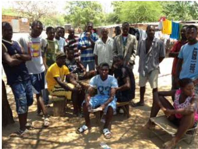
Group of Haitian workers from a typical Haitian banana worker's residential area

However, the reality of the observation in situ reveals, as it is shown in the photograph below, that Haitian migrant workers are predominantly men. Women and girls may be present in the Haitian households in each of the three exporting provinces, but very few of them work in the banana industry. Conversely, the latter may be employed in other agricultural sectors that exclusively supply the national, but also Haitian, markets with rice, vegetables, fruit, etc.