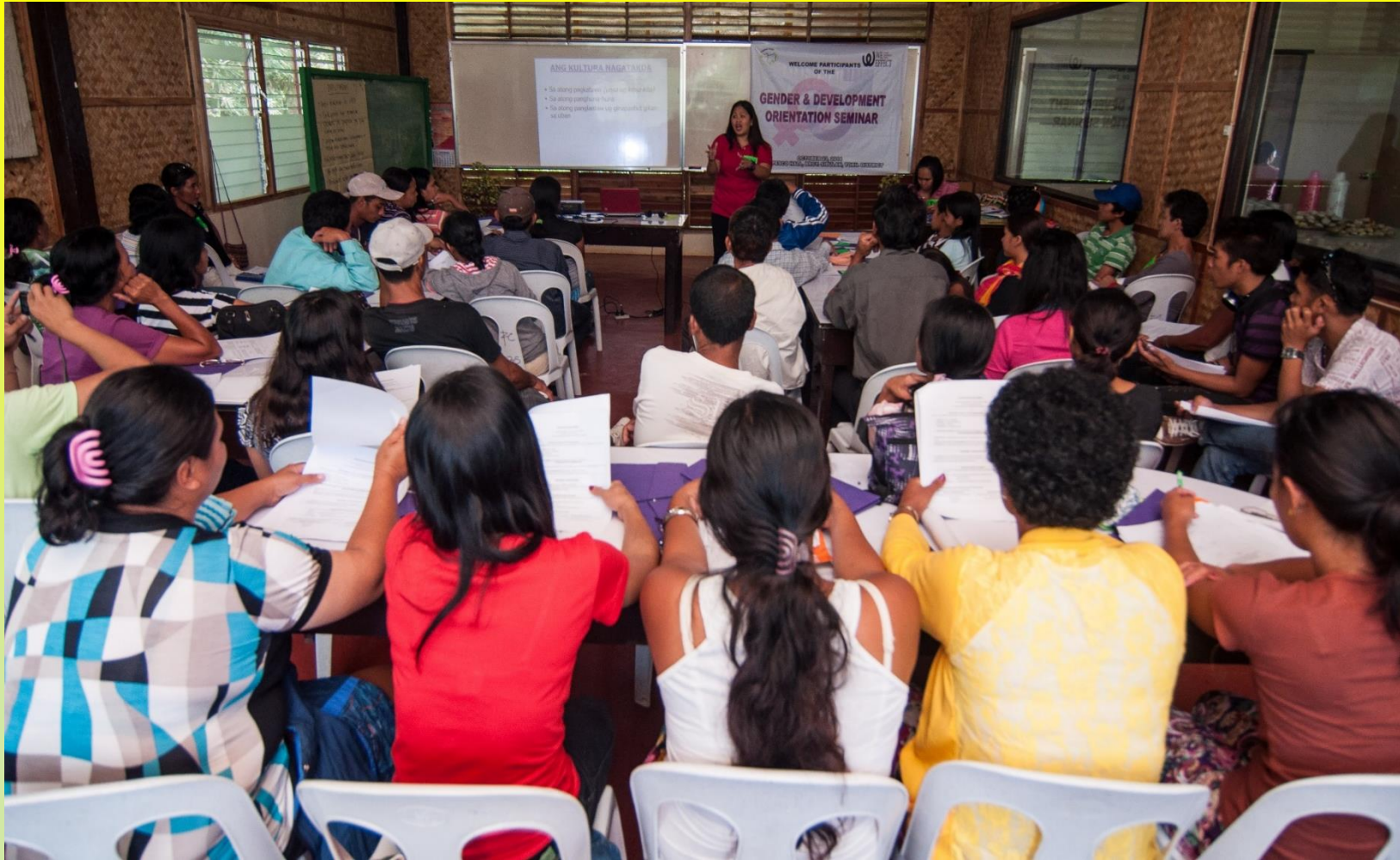
Continuous Gender Sensitivity Trainings (GST) Sibulan Organic Banana Growers Multi-purpose Coop. (SOBAGROMCO) – 2014 to 2016