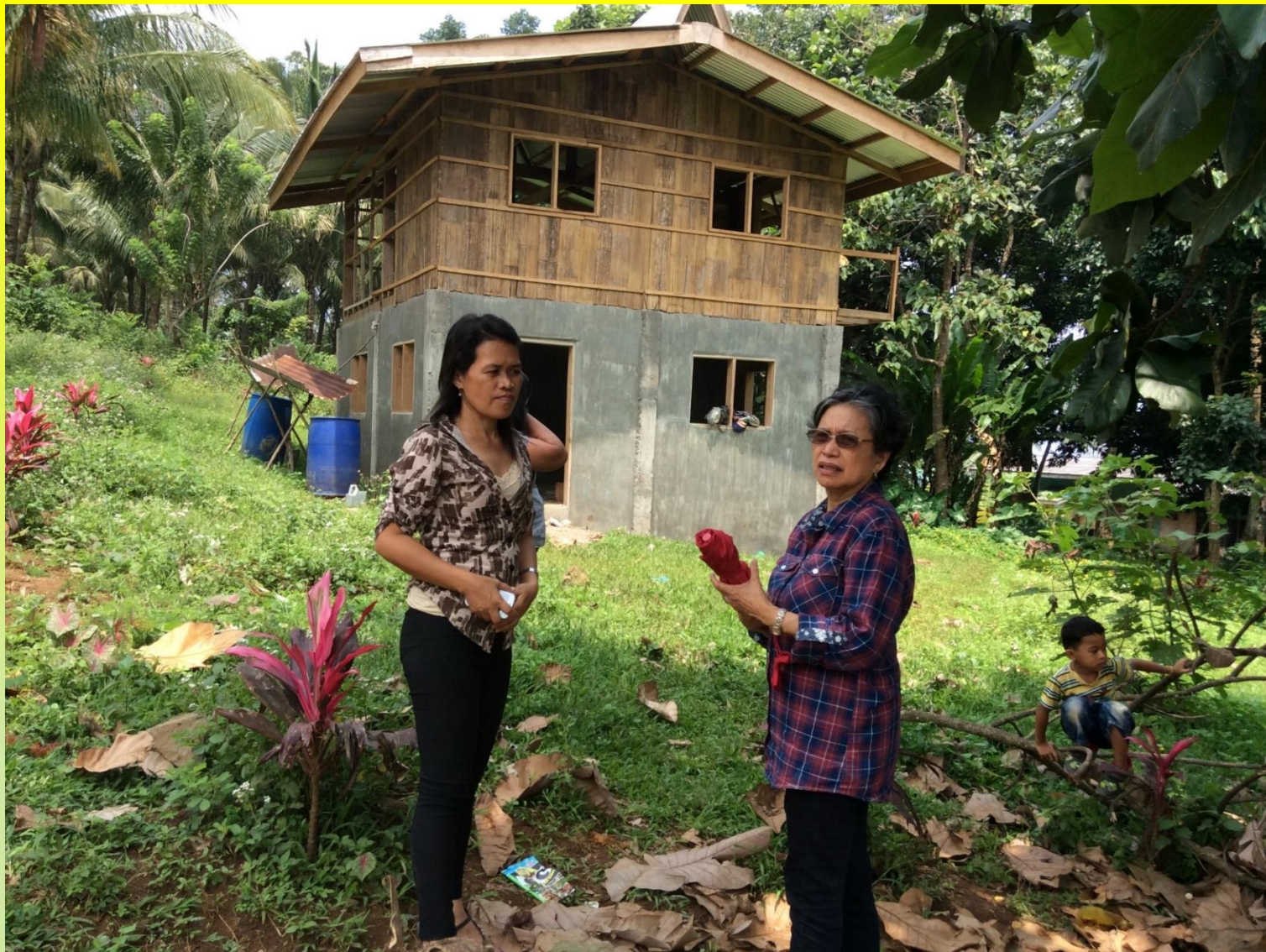
Creative Nurturing Communities (CNC) - Pageno Project - 2014 to 2016 Assisting in the establishment of Indigenous People's Learning Center – A Special Project at Mt. Apo Elementary School